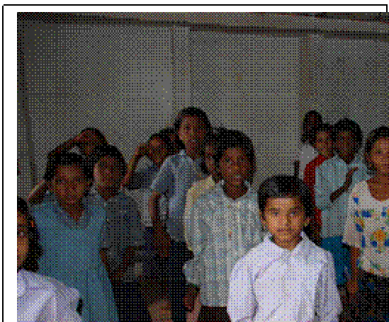
Girls from Khari Ashramschoool