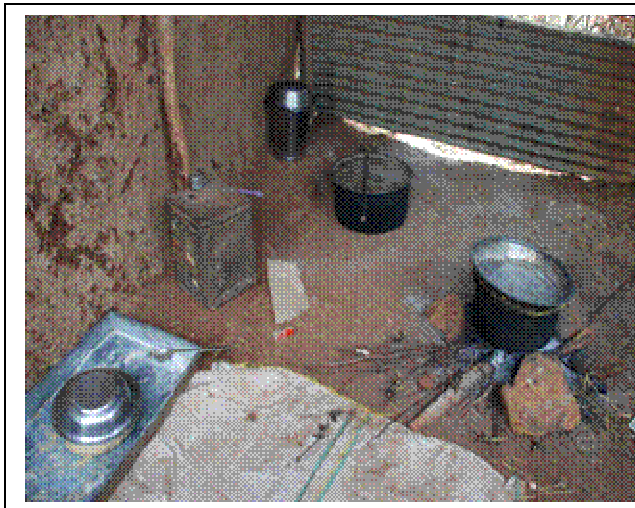
The place used for cooking food in Bobdo Anganwadi

quite weak and if funds are not made available to them immediately, then the program of supplying nutritious diet to malnourished children's through Anganwadi might be stopped within a week .